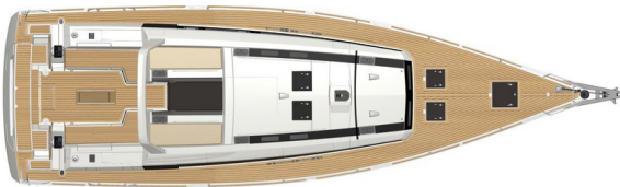
3 cabins + 2 heads: